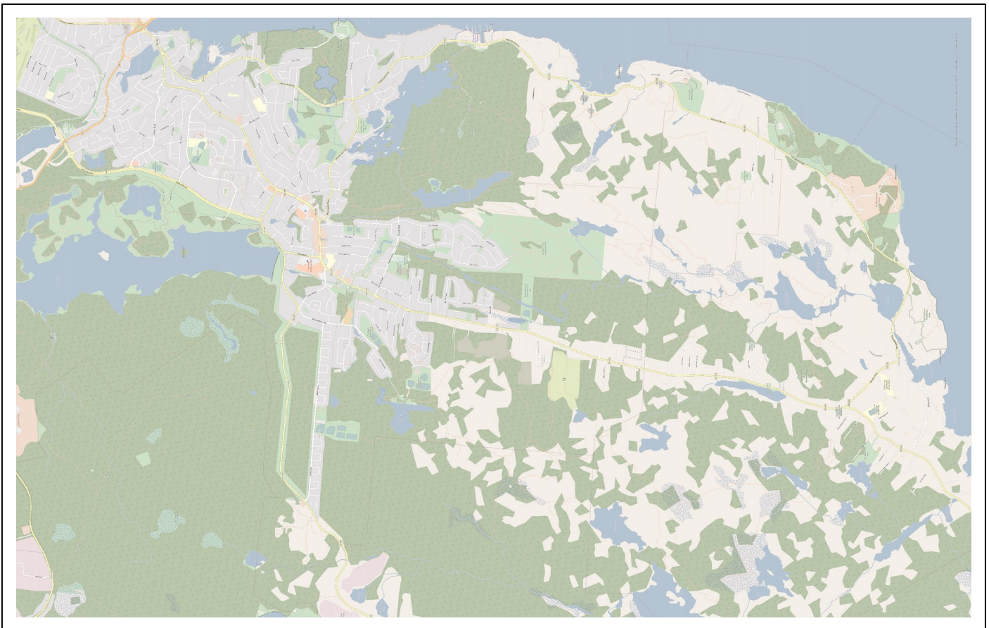
Figure 1. A map of Spryfield